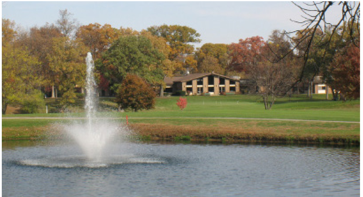
Pontiac Elks Club

The city gets everything, including the golf clubhouse and the attached restaurant and hospitality center, plus an indoor pool. The Elks will run the restaurant and the city will run the golf course and pro shop.